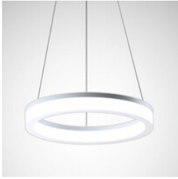
Polaron IQ LED suspended luminaire