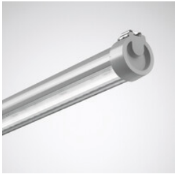
Duroxo LED surface-mounted luminaire IP69K

Duroxo G2 LED is completely gas-proof, resisting sulphur and ammonia vapours as easily as water and cleaning chemicals. As a result the luminaire with a service life of 100,000 h (L80 at tq 35°C) provides high quality, energy-efficient light in challenging surroundings such as tyre warehouses and vehicle wash lines.